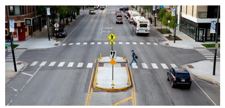
Pedestrian Refuge Islands to provide refuge to people crossing wide streets