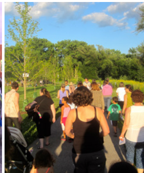
EUGENE FIELD PARK WETLAND WALK with Albany Park Neighbors