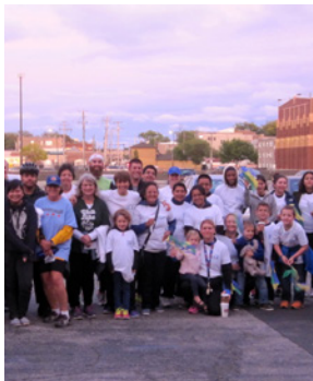
ALBANY PARK 5K RUN/WALK FOR PEACE with 33rd Ward and Athletico Physical Therapy