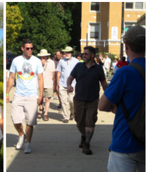
WORLD FEST ARCHITECTURE WALK with Forgotten Chicago and PEAP Block Club

"Thank you for the program! It helped make me feel more confident to start biking more—and the community engagement made me happy to live in Albany Park."