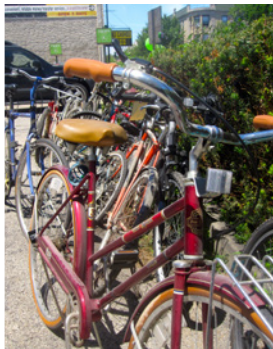
BIKES N' ROSES BIKE DRIVE with Bikes N' Roses, CHIRP Radio, North River Commission, and Communities United