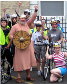
BIKING LIKE A VIKING RIDE with North Park University