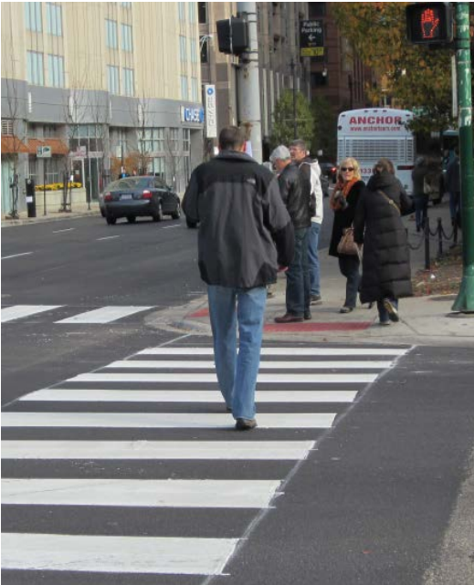
High Visibility Crosswalk