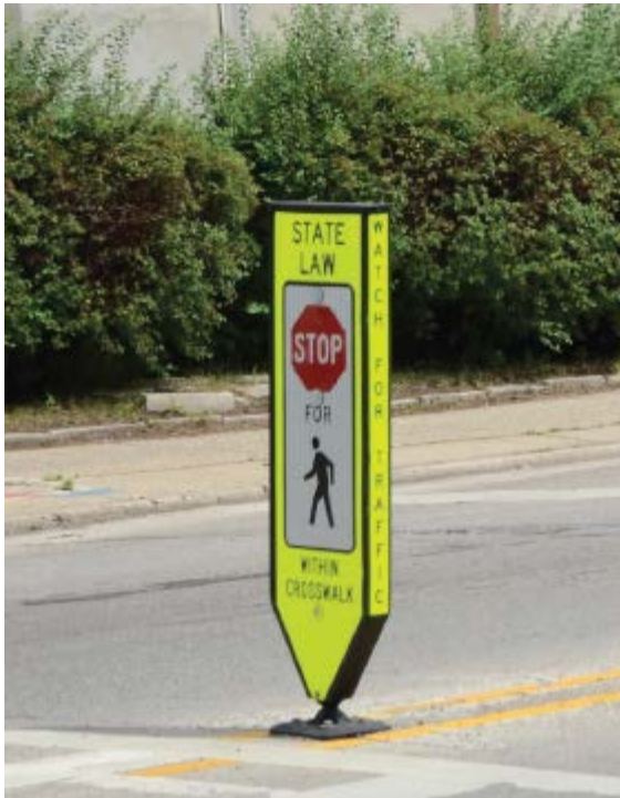
Stop for Pedestrian Sign