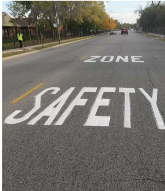
Safety Zone Stencils